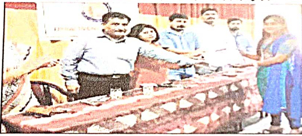
कार्यावाहिका को प्रमाणपत्र वितरित करते हुए छात्राओं को प्रमाणपत्र वितरित किया गया।